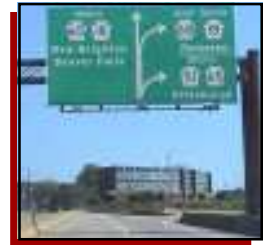
Bear left on bridge.

Adequate street parking is available on adjacent streets.